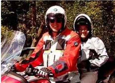
Armored textile jackets: Cordura left and fully ventilated right

An alternative to leather is protective equipment constructed of man-made textiles. These can offer improved weather protection from heat, cold, and water, and the increased utility these garments tend to provide in terms of pockets and vents. Common materials include high density (600–1000 Denier ) ballistic nylon (e.g., Cordura ) and Kevlar , or blends of Kevlar, Cordura, and Lycra; and often include waterproof liners made from materials such as Gore-Tex . Additional protection may be provided by armour (CE approved is desirable) and airbag systems.