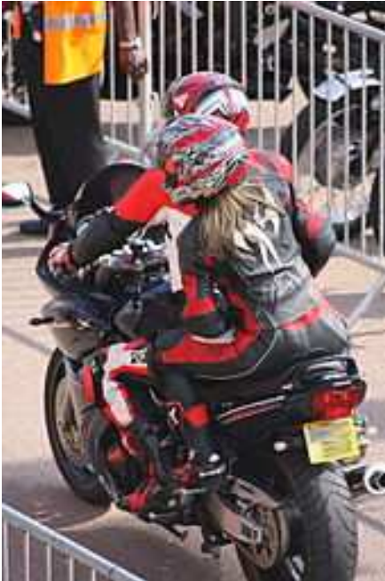
A rider and passenger wearing racing leathers

Leathers are 1-piece suits, or 2-piece jackets and trousers worn by motorcyclists mainly for protection in a crash. The leather used is not fashion leather but protective leather which is stronger, moderately flexible and much