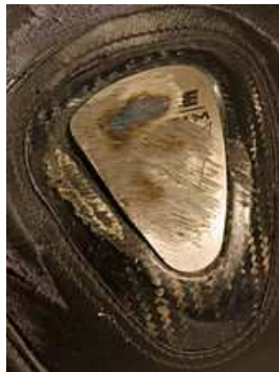
Shoulder panel of motorcycling racing suit after a ca. 150 km/h (94 mph) crash. The rider escaped unharmed.

Originally, motorcycle leathers were adapted from tank corps gear immediately following World War I. Duster coats , which tended to catch in the wheels, were switched for short coats. Wide-pegged breeches were worn by some motorcycle police and by dispatch riders in World War II , but were largely abandoned in the post-war years because of their association with certain Nazi uniforms.